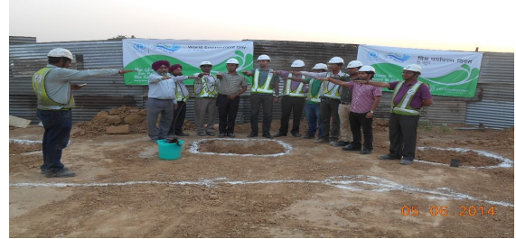
Figure 5: Proper utilization of Environment Day