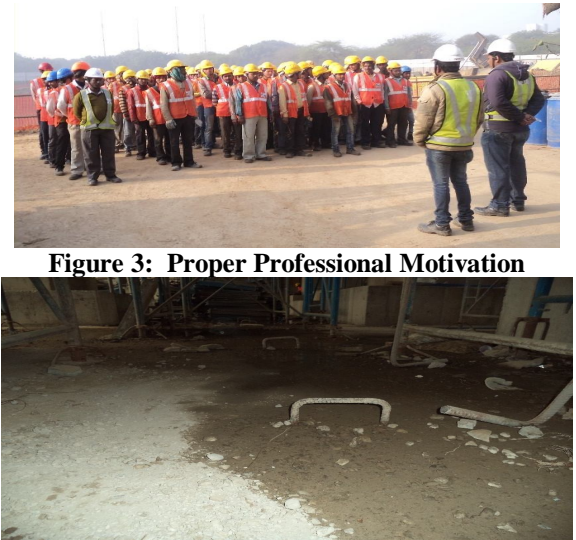
Figure 4: No Vertical Opening in the site